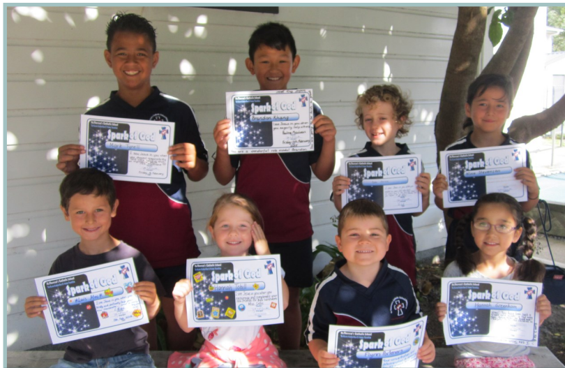
Sparks of God - Week 2, Term 1

PLEASE come along - everyone's support is needed and very much appreciated.