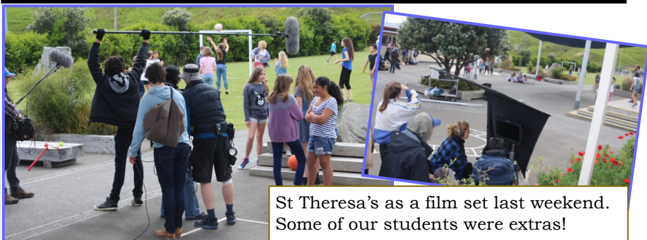
St Theresa's as a film set last weekend. Some of our students were extras!