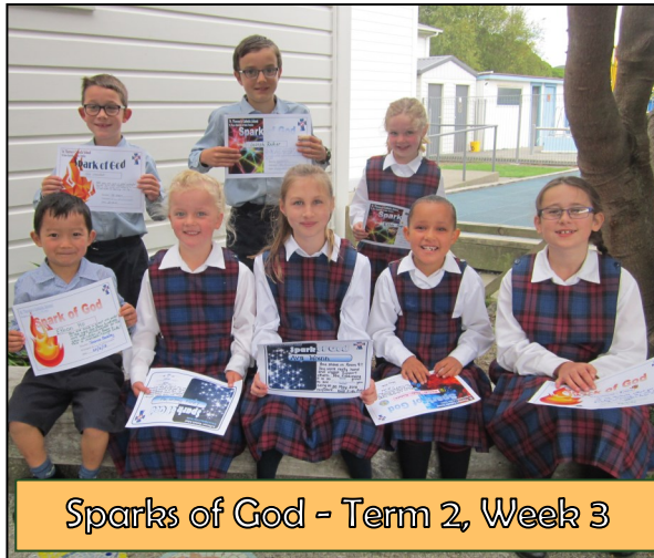
Sparks of God - Term 2, Week 3

◇ Next Uniform fittings on site - Fri. 10th June