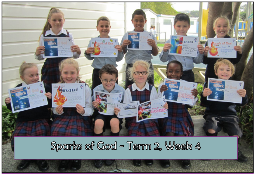
Sparks of God - Term 2, Week 4