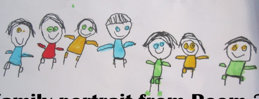
Family portrait from Room 3