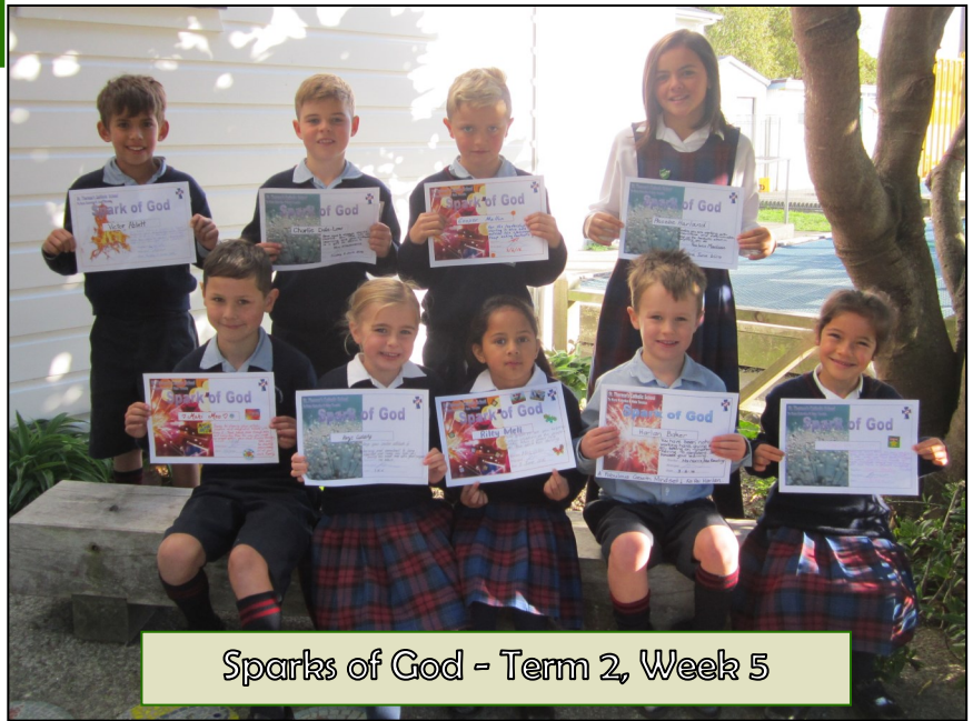
Sparks of God - Term 2, Week 5

Please keep 23 June free for our school Matariki Celebration. We will be starting the evening with a Powhiri welcome at 5pm and intend being finished by 7pm. As part of this celebration we will be sharing a Hangi for dinner. The cost of this will be approx. $5 per plate. Tickets will be on sale next week.