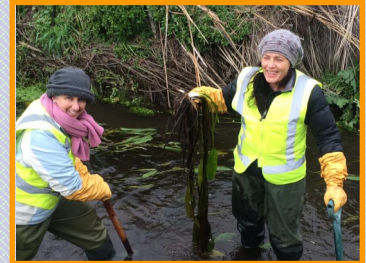
Two of the 'helpers' at the Taupo Stream Day organised by the Room 10 students. Looks like they're having way too much fun!

It was fantastic to be involved in the Stream Day on Saturday. It was a very cold day however we all worked hard to keep warm. Thank you again to those children, staff and families who came down to the Taupo Stream and helped out. This is another great example of our school's "Faith in Action".