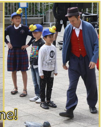
Seniors' Capital E Trip - fun for everyone!