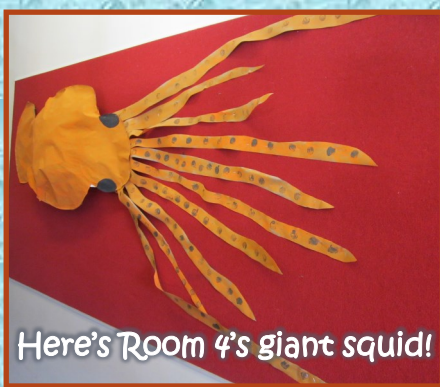
Here's Room 4's giant squid!