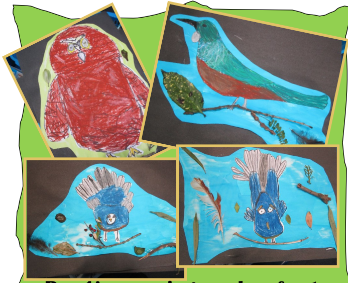
Rm 1's amazing works of art