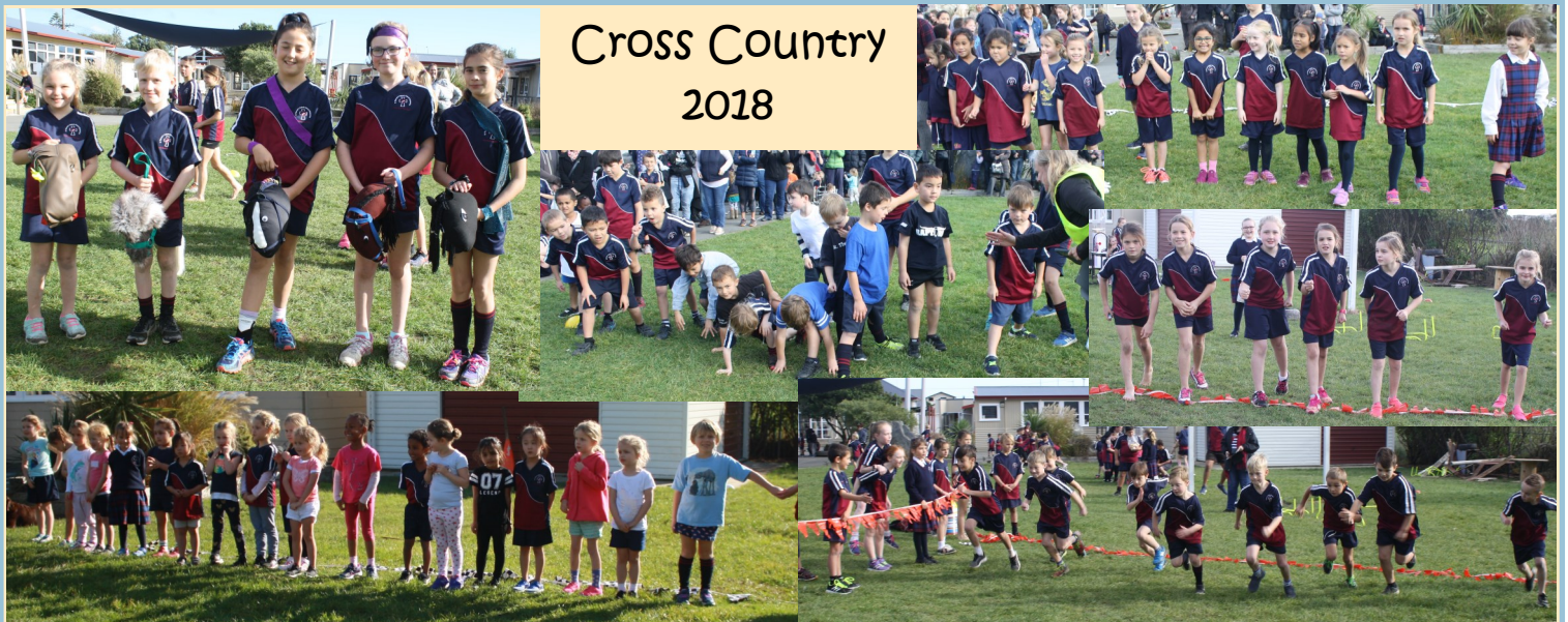
Cross Country 2018

What lasts? What has value in life? What treasures don't disappear? Definitely two: God and our neighbour. - Pope Francis