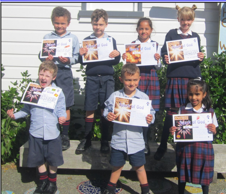
Sparks of God - Week 10

Sunday is the day to say to God: thank you Lord, for life, for your mercy and for all your gifts! - Pope Francis