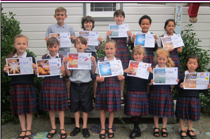
Sparks of God - Term 4, Week 2