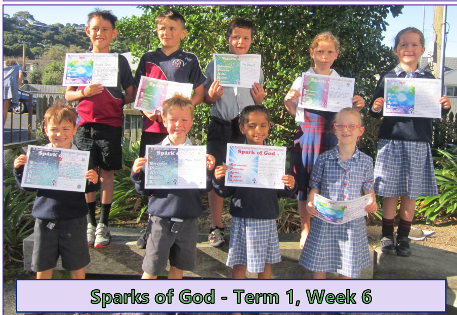
Sparks of God - Term 1, Week 6

https://www.entertainmentbook.co.nz/orderbooks/105w585